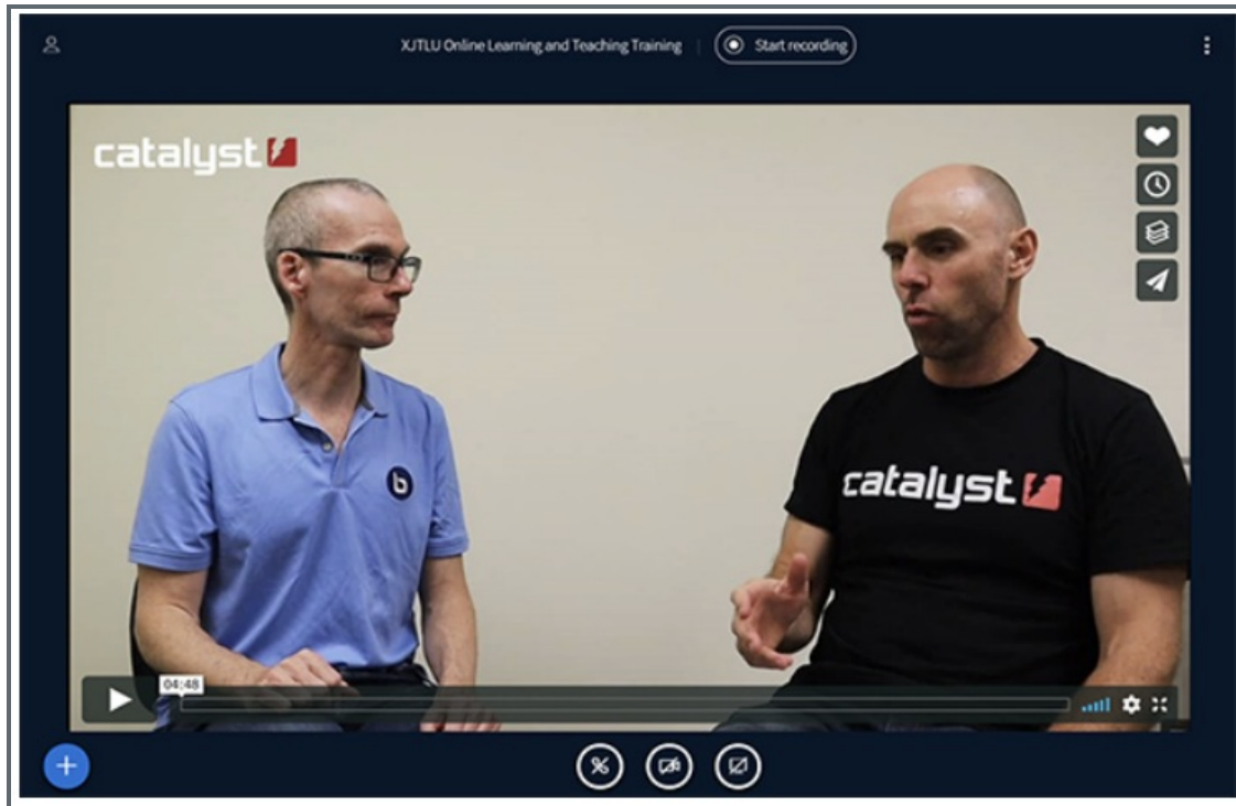
An example of an external video shared in the BigBlueButton activity